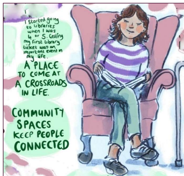
A 'visual minute' taken from one of our project events.

Given our case study organisation, the vast majority of our participants were women. We drew on stories from a diverse range of participants, including: